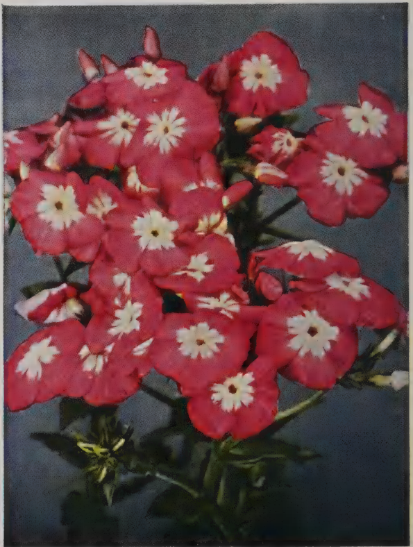
PHLOX, ROSY MORN See description on page 25